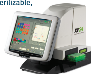
XF24 Extracellular Flux Analyzer