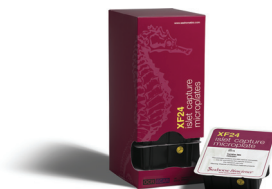
XF24 Islet Capture Microplates

Product: Capture Screen Insert Tool Part Number: 101135-100 Price: $265 Contents: 1 reusable, sterilizable, insert device