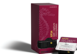
XF24 Islet Capture Microplates

Product: Capture Screen Insert Tool Part Number: 101135-100 Price: $265 Contents: 1 reusable, sterilizable, insert device