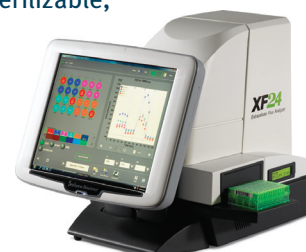
XF24 Extracellular Flux Analyzer